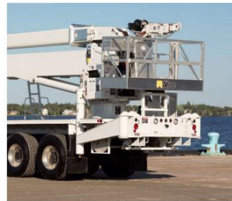
OPTIMIZED BOOM DESIGN COMPLIES WITH FEDERAL BRIDGE FORMULA ON FIVE AXLE CHASSIS